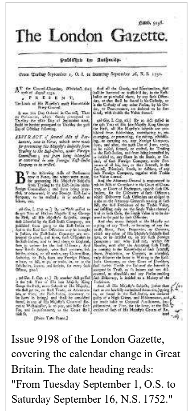
Issue 9198 of the London Gazette, covering the calendar change in Great Britain. The date heading reads: "From Tuesday September 1, O.S. to Saturday September 16, N.S. 1752."

Through enactment of the Calendar (New Style) Act 1750, Britain and the British Empire (including the eastern part of what is now the United States) adopted the Gregorian calendar in 1752, by which time it was necessary to correct by 11 days. Wednesday, 2 September 1752, was followed by Thursday, 14 September 1752. Claims that rioters demanded "Give us our eleven days" grew out of a misinterpretation of a painting by William Hogarth. [11] The British tax year traditionally began on Lady Day (25 March) on the Julian