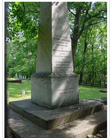
Thomas Jefferson's tombstone. Written below the epitaph is "BORN APRIL 2 1743 O.S. DIED JULY 4 1826"