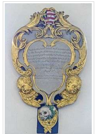
A contemporary memorial plaque showing date of death as January 1708/9