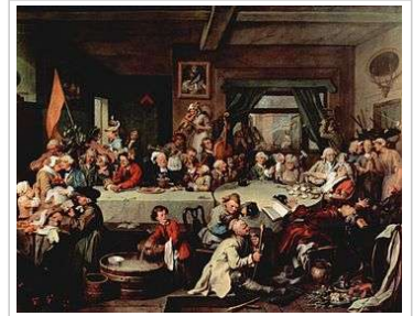
William Hogarth painting: Humours of an Election (c. 1755), which is the main source for "Give us our Eleven Days".